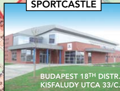
BUDAPEST 18 TH DISTR. KISFALUDY UTCA 33/C.