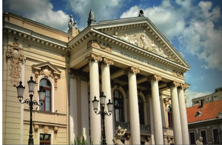
Teatrul - Regina Maria • Theatre - Queen Mary