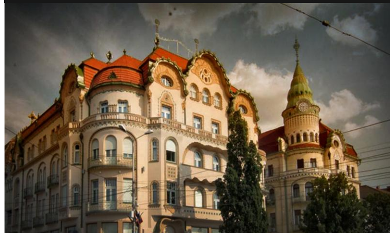
Palatul - Vulturul Negru • Palace - Black Eagle