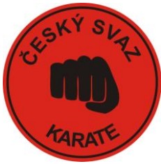
CZECH KARATE FEDERATION