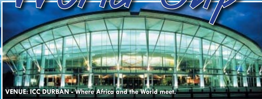
VENUE: ICC DURBAN - Where Africa and the World meet.