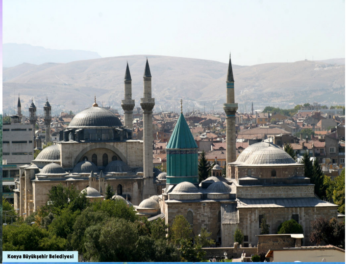
Konya Büyükşehir Belediyesi