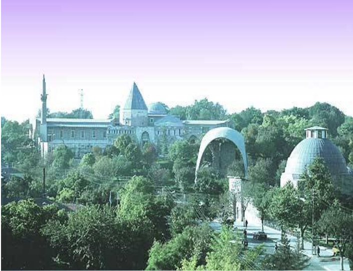
View of the Mevlâna museum, the şadırvan and the green dome.