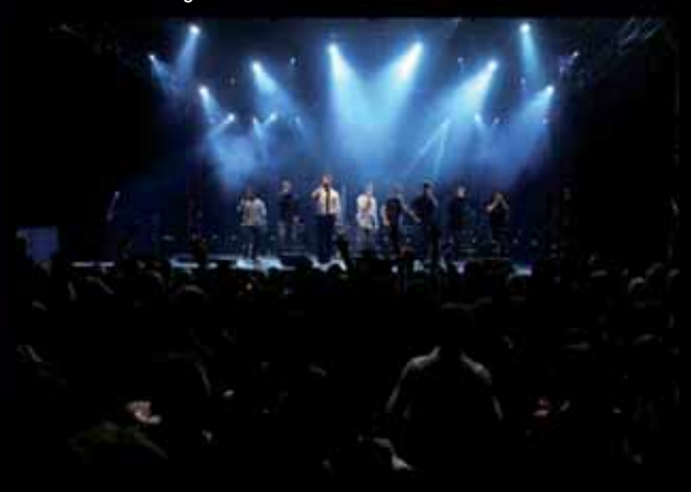
EXPO XXI Sport Arena, Warsaw, Poland

EXPO XXI Warsaw provides the latest in IT and communications technology and offers an innovative central reservation and booking service for organizers, via telephone or the Internet. As an organizer, exhibitor or visitor you will find that the centre provides convenient on-site services such as stand design, construction, freight forwarding and customs clearance as well as catering and accommodation.