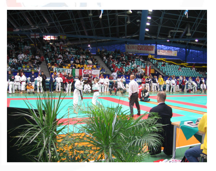
"Orbita" Sport Complex